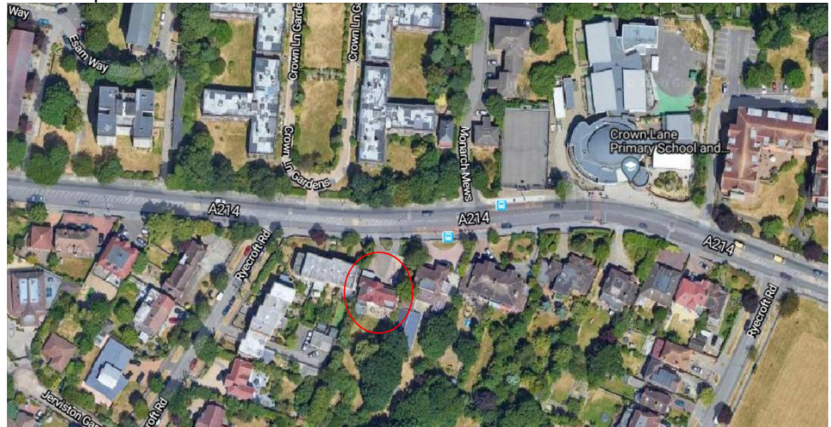
Figure 2: Aerial street view highlighting the proposed site within the surrounding streetscene